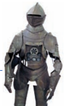
a model of Leonardo da Vinci's mechanical man