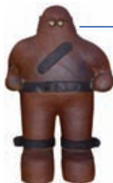
the golems of medieval Jewish legend

The word 'robot' comes from the Czech word robota , meaning drudgery or labour.