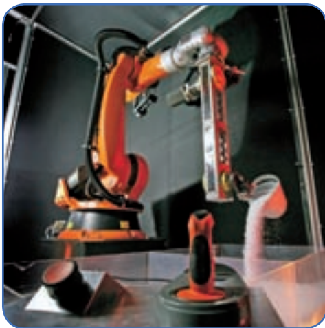
robotics at work in a chemical factory

If you think robots are mainly the stuff of sci-fi movies, think again. Right now, all over the world, robots are on the move. They're painting cars at Ford plants, assembling toys for Mattel, walking into live volcanoes, driving trains in Paris, and operating as surveillance networks for businesses. As they grow tougher, nimbler, and smarter, today's robots are doing more and more things we can't – or don't want to – do.